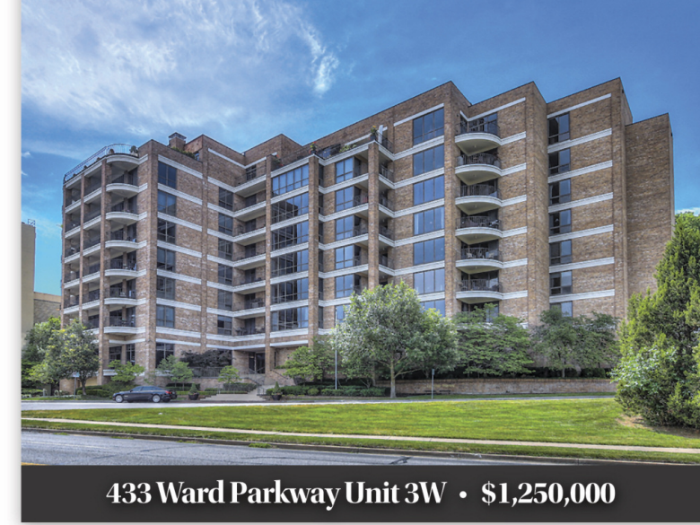
433 Ward Parkway Unit 3W • $1,250,000

University and has combined her technology skills to ensure the marketing of a luxury home is successful and prepared to meet and exceed expectations achieving top dollar for sellers and the best deal for buyers.