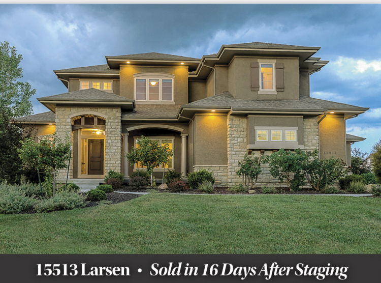
15513 Larsen • Sold in 16 Days After Staging