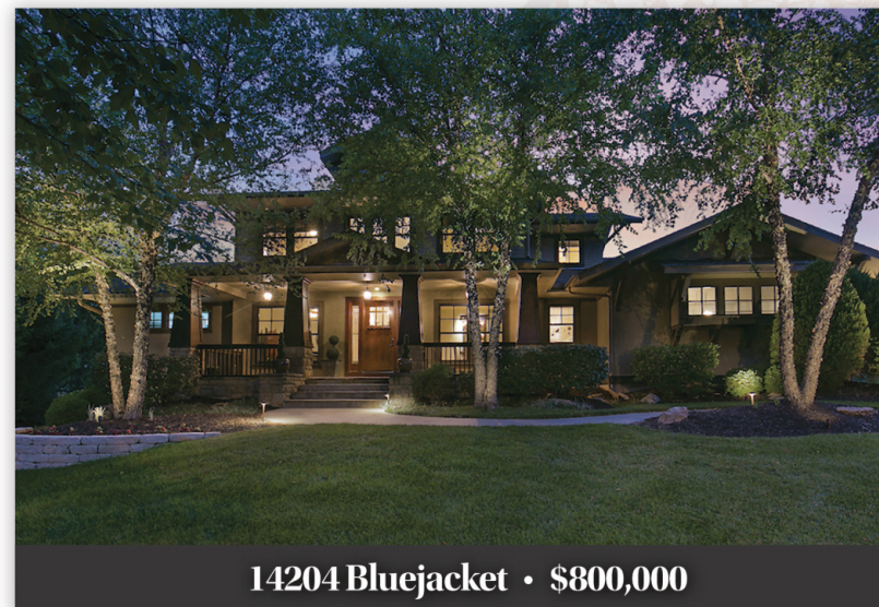
14204 Bluejacket • $800,000