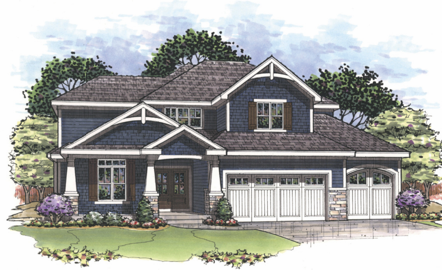
ARCHER'S LANDING AT SUNDANCE - THE EMRIK III MODEL