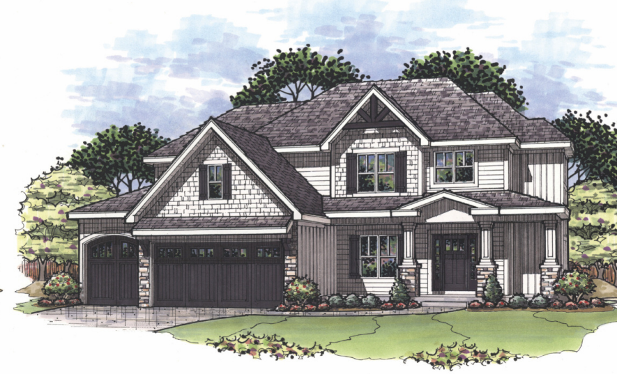
STONEBRIDGE COMMUNITIES - THE LANDON MODEL